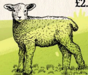
Lamb (£2.95 supplement)