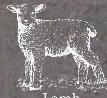
Lamb £2.95 supplement